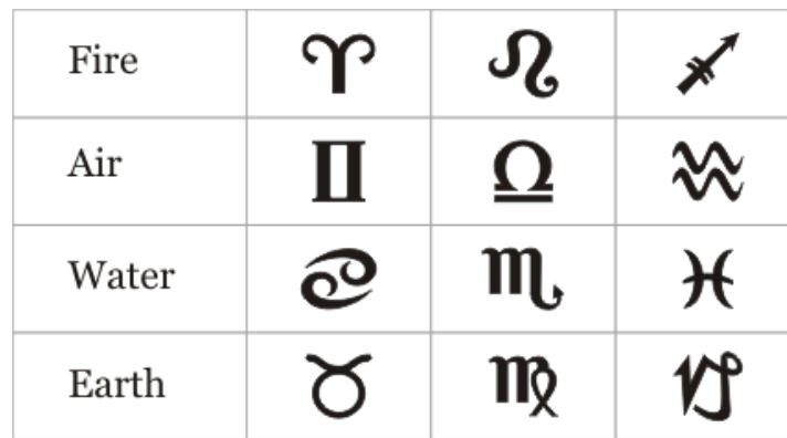
Zodiac signs attributed to the elements.

Thus we find that in the occidental view planet Earth is moving from the water-sign Pisces to the air-sign Aquarius, which may be interpreted superficially as "from a region where light is diminished and deep darkness lies below" to "a region above the waters, where mists may linger, yet moving upwards towards ever-expanding light". In the oriental view, from Virgo (Earth) to Leo (Fire), the symbolism is "from the most dense, terrestrial-material sign towards the fluid, intellectual, flexible region of celestial light".