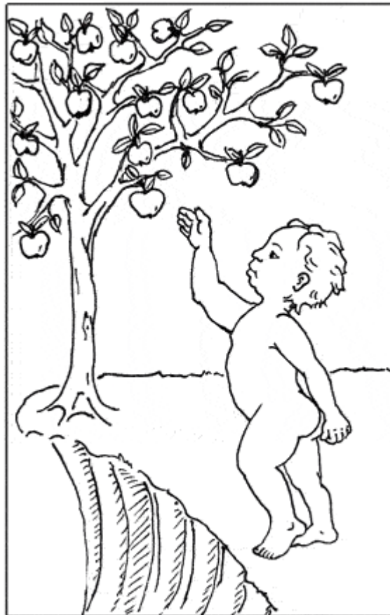
Rectified traditional card

A proper representation of The Fool is also the light-green colouring of an early dawn in spring, "at the beginning of the world" or "when the world was young", open to all possibilities, the Creative about to enter Creation.