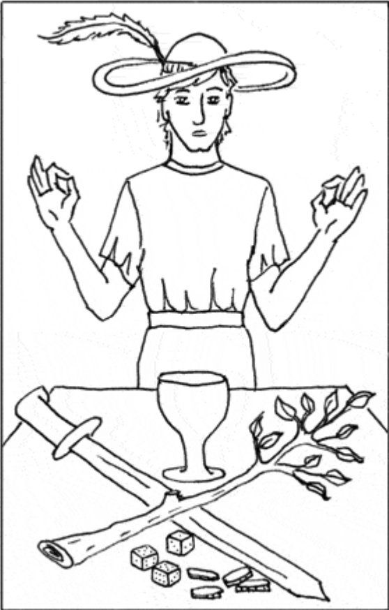
Rectified traditional card