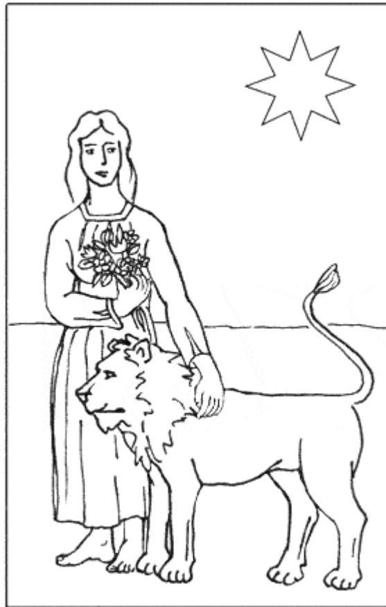
Rectified traditional card

The appropriate incense is Sandalwood, preferentially associated with Myrrhe. Aloe and Frankincense also are good, a mixture of all four calls forth the whole power of the Sun.