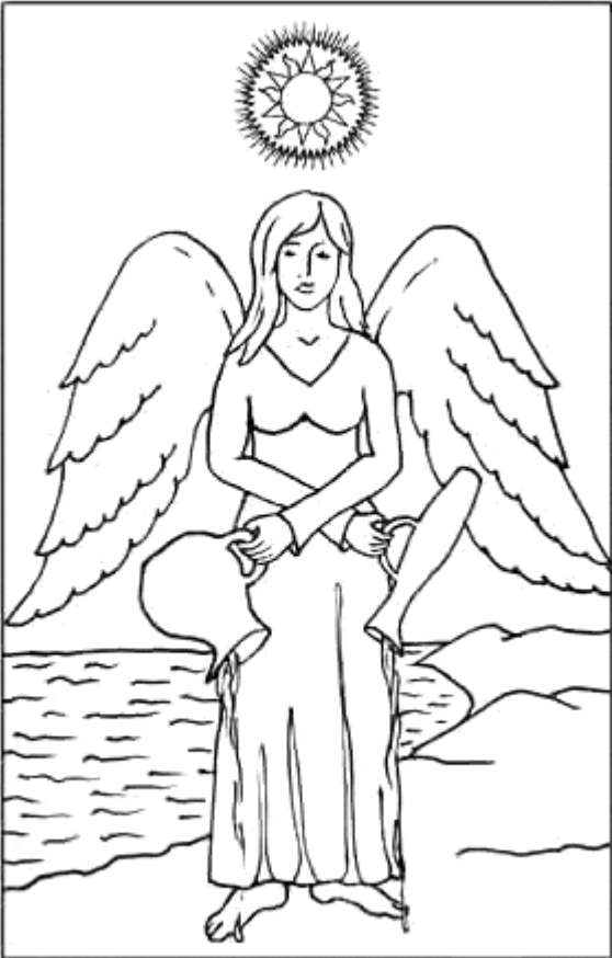
Rectified traditional card