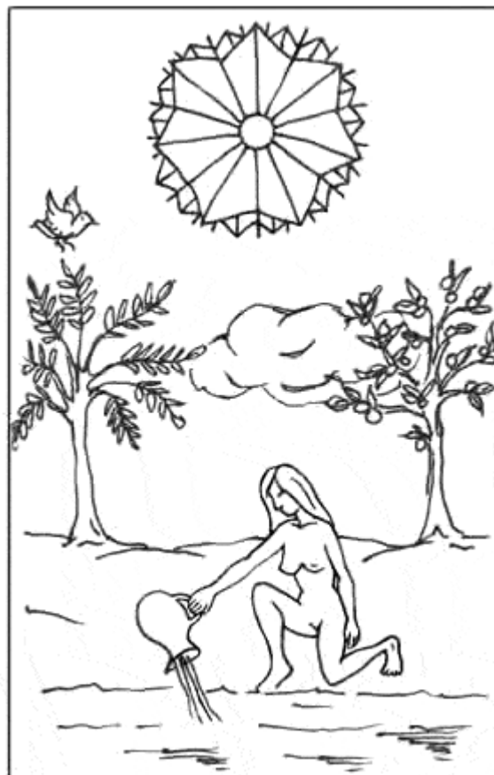
Rectified traditional card

Aquarius and Aries are commonly associated with Trump 17. Gemini is associated with the Hebrew letter Zain. If this can reflect the whole symbolism, this is acceptable, yet it must be born in mind that these higher trumps do not reflect any limitative aspects of the Zodiac anymore. The Body of Light is totally, uncompromisingly free, freedom was the very seed it sprung from, no outside influences touch this body. Only the dynamic moving vessel of the physical body is still under the influence of the changing spheres, their aspects and their dynamics. "Freedom leads to Freedom", as G.I. Gurdjieff said.