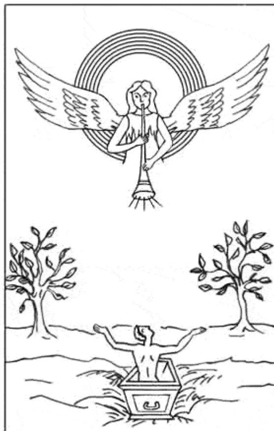
Rectified traditional card

correct as is possible within time and space, bettered only, maybe, by the station of Trump 21. But these are the highest aspects. And therefore the temples of old were laid out to facilitate the oracles, by their geometry, angles and measures, their direction, altitude and latitude, thus making them reflect the ethereal spheres of the single planets, the Moon and the Sun. Thus, in the world that ended with the advent of the Age of Pisces-Virgo, the temple of Salomon in Jerusalem is said to have been laid out for the oracle of Saturn, the Jupiter or Zeus-temple in Olympia and Athens for the oracle of Jupiter, the Zikkurat-towers of Babylon for Mars (as also Eleusium), Delphi for the Sun and Mars, and the temple of Diana at Ephesus for the Moon-oracle. In Teotihuacan, close to Mexico City, all spheres had their proper temple, and so the greatest temple-complex in the world is to be found there, stretched over many miles (to include the astronomic distances between the planets). What wonder. But the Oracle, the proper Augury, is also a wonder, for it calls upon all spheres to show their qualitative "intent" via their respective synchronic station. Time, Polarity and Synchronicity are aspects of the Divine, to see them as such is to accept the higher will of God, the unsurpassable intent of Tao.